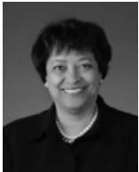
Kay Coles James Age 62 Director Since 2006