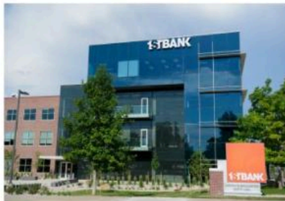
FirstBank opens its new corporate headquarters in Colorado after nearly ten years of construction and renovation on June 22, 2016.

Combined, the two will rank as metro Denver's largest banking group